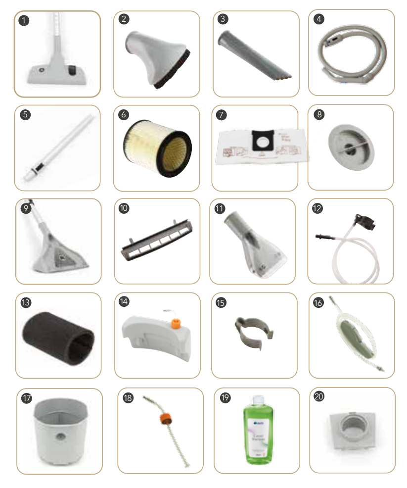
1- Floor cleaning nozzle, 2- Eliptical brush, 3- Crevice tool, 4- Suction hose, 5- Telescopic tube, 6- Cartridge filter, 7- Dust bag, 8- Filter cover, 9- Big washing nozzle, 10- Hard floor rubber, 11- Mini washing nozzle, 12- Washing set spray pipe, 13- Sponge filter, 14- Clean water tank, 15- Pipe clamp, 16- Spray trigger, 17- Dirty water reservior (Only QVac), 18- Suction pipe, 19- Shampoo, 20- Blowing adaptor.